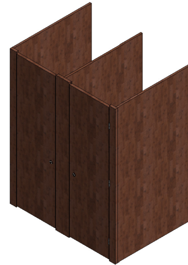
01 3D View